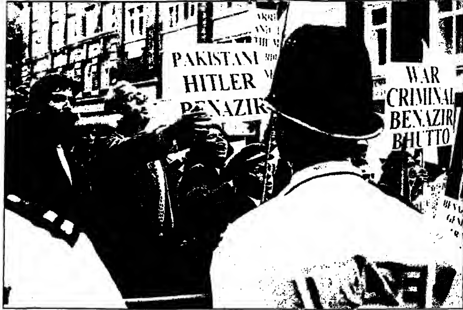
Anti-Benazir Bhutto protesters shout slogans under the watchful eye of police outside the Connaught Rooms in London yesterday where the Pakistani prime minister was delivering the keynote speech to the International Institute for Strategic Studies. Bhutto is in Britain on a two-day official visit.